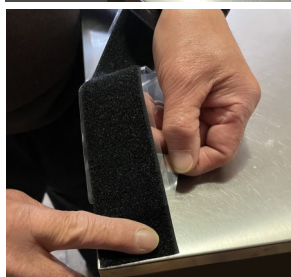
Step 3: Carefully keep removing the clear plastic backing from the self adhesive strip.