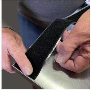
Step 2: Firmly press the self-adhesive "loop" strip onto the edge of your table top.