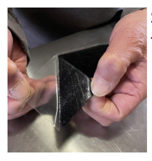
Step 1: Remove the clear plastic from the self-adhesive "loop" strip that is supplied with your table drape.