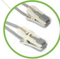
Large/Small Size Sensors