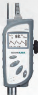
Bed Rail Mount