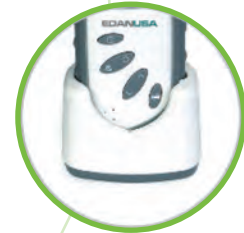
Battery Charger Stand